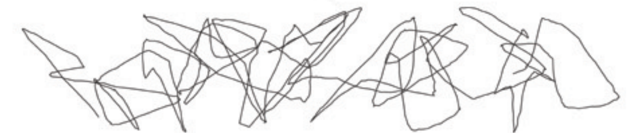
Two different strokes applied to a same path (top)

We then add the stochastic factors into the turtle graphics interpretation process to enhance the feel of human touch. A Python module adapted by the authors based on SVGdraw is used along with Batik SVG Rasterizer and Adobe Illustrator to render SVG as the final output.