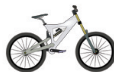
Typical vector graphics